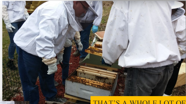
THAT'S A WHOLE LOT OF BEES