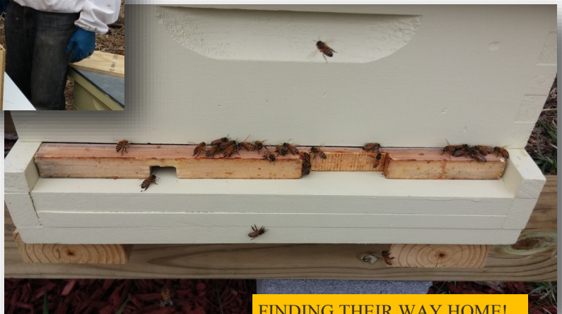
FINDING THEIR WAY HOME!

A deep super filled with honey weighs about 90lbs, A medium weighs about 60lbs, and a small