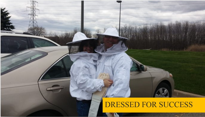
DRESSED FOR SUCCESS

Professor Einstein, the learned scientist, once calculated that if all bees disappeared off the earth, four years later all humans would also have disappeared. Abeilles et fleurs, June, 1965.