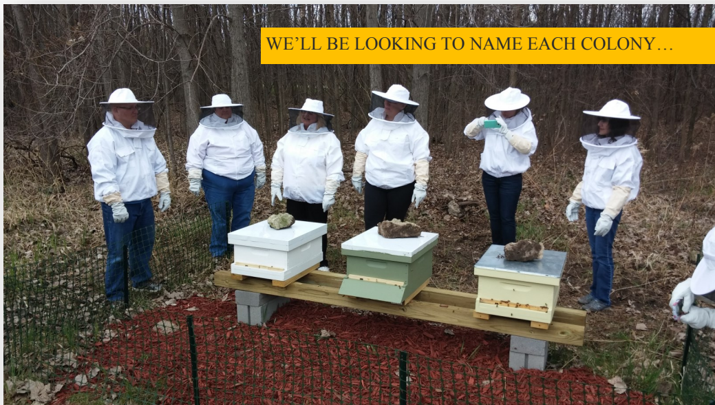
WE'LL BE LOOKING TO NAME EACH COLONY...

In our next issue, "The 1st Hive Inspection" we should see some real progress within the bottom brood chamber and possibly we will be adding another hive box