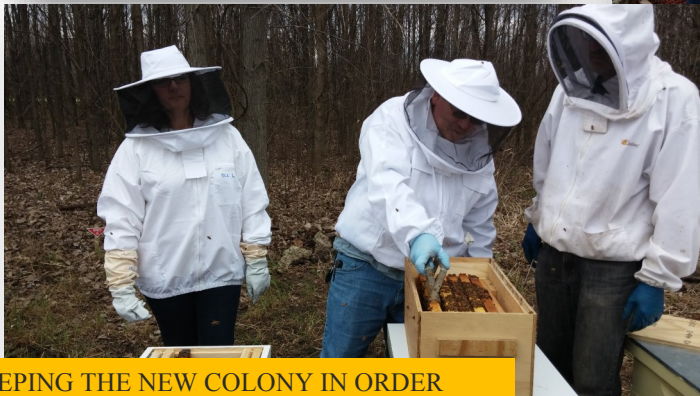
KEEPING THE NEW COLONY IN ORDER