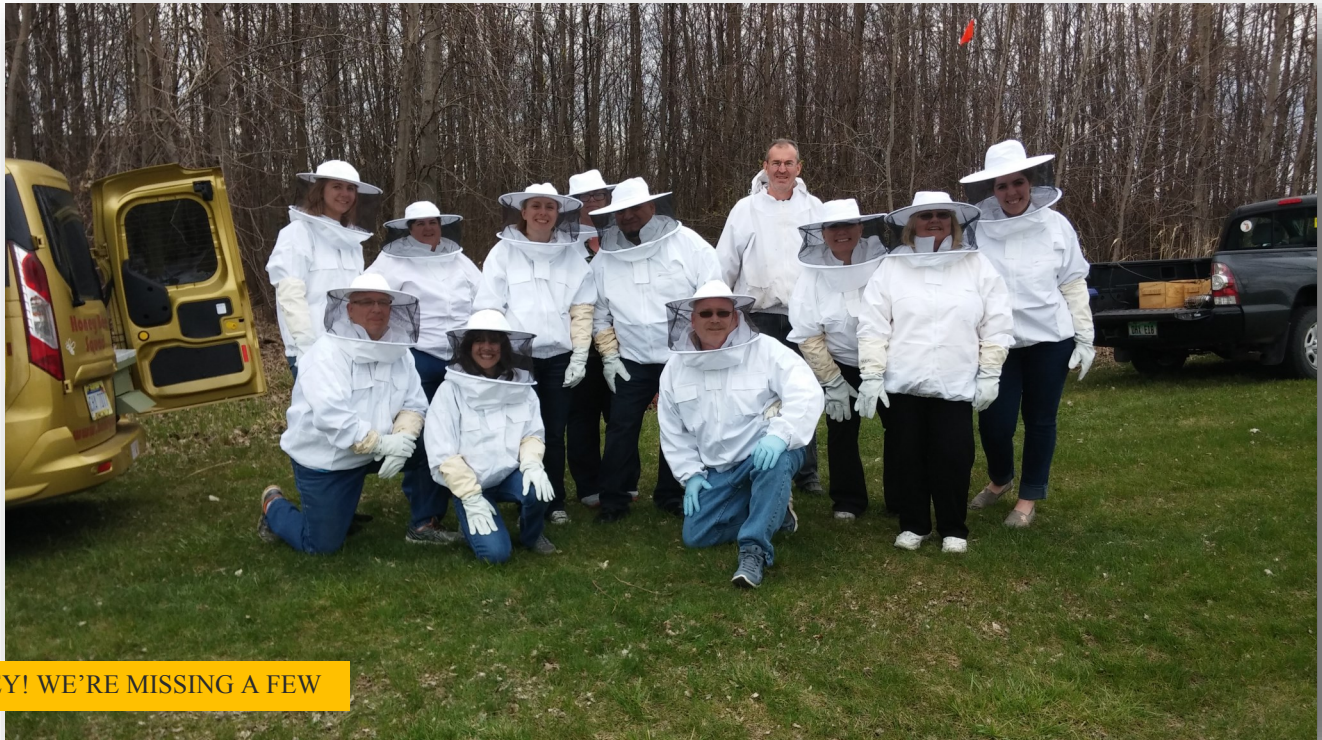
HEY! WE'RE MISSING A FEW