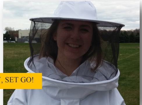
READY, SET GO!