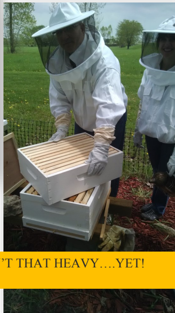
IT ISN'T THAT HEAVY....YET!