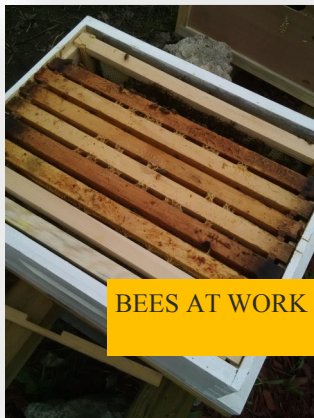
BEEES AT WORK ON A