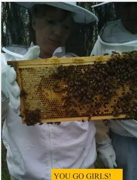
YOU GO GIRLS!