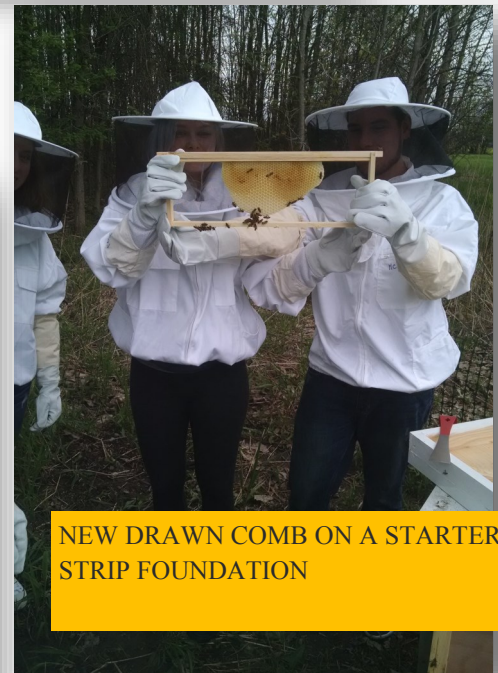
NEW DRAWN COMB ON A STARTER STRIP FOUNDATION